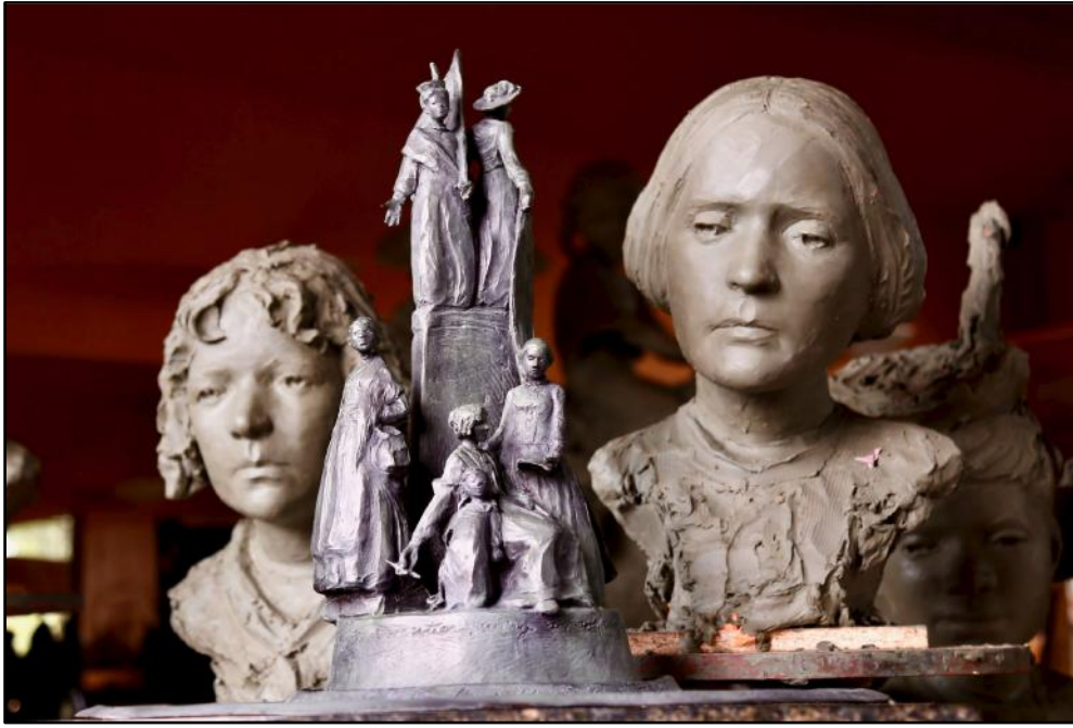
Studio of Jane DeDecker

A studio version of "Every Word We Utter" near the final sculpture, still in production.