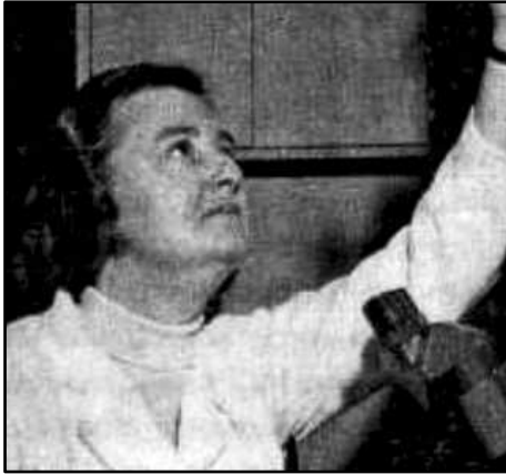
June Dalziel Almeida (Oct. 5, 1930 – Dec. 1, 2007) was a Scottish virologist who, with little formal education, became a Doctor of Science and a pioneer in virus imaging, identification and diagnosis.

Scientific pioneer June Almeida is finally being acknowledged for virology breakthroughs she made a half-century ago. June's work has come roaring back into focus during the present pandemic.