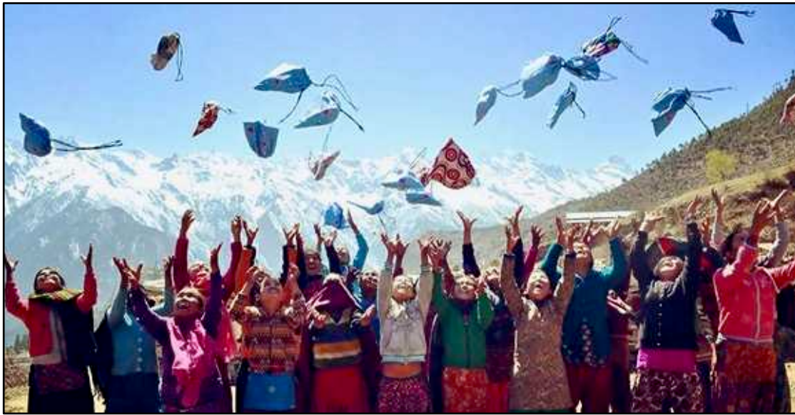
Girls in Nepal celebrate as they receive their Days for Girls kits.