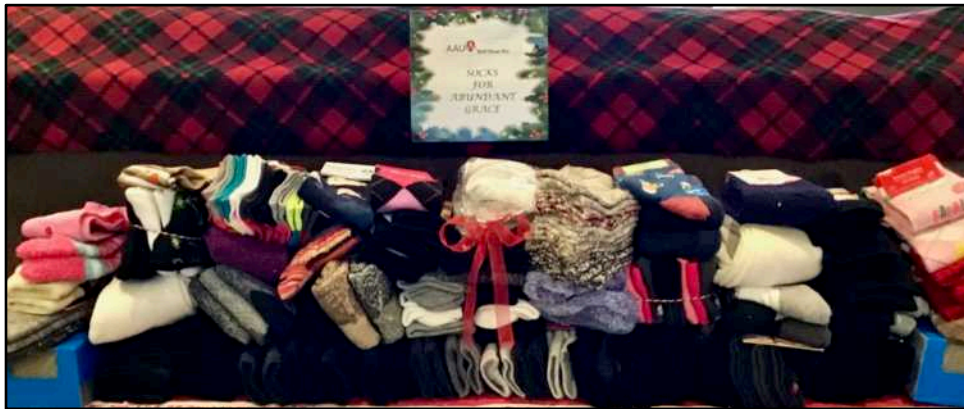
We collected 172 pairs of socks for Abundant Grace!